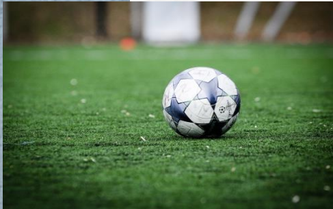
Freedom - Football Cup